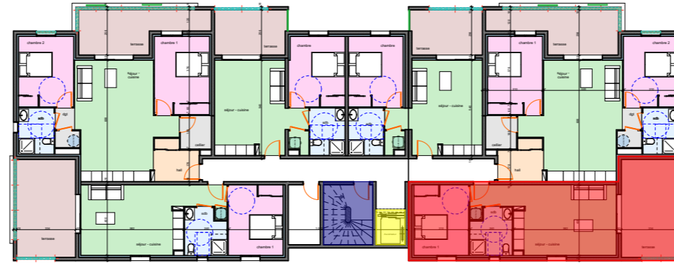
TABLEAU DE SURFACES