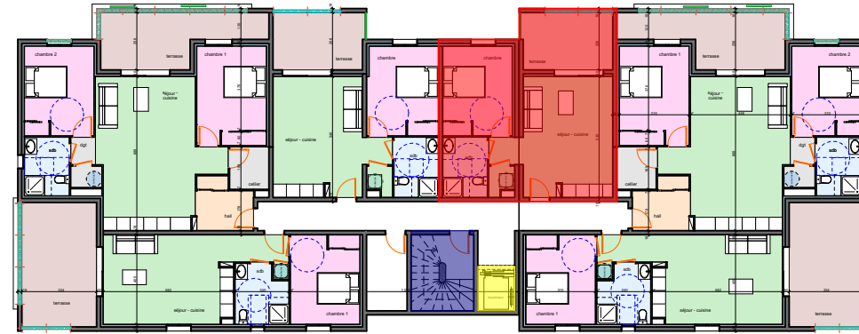
TABLEAU DE SURFACES