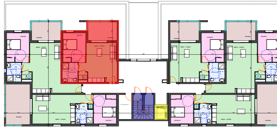
TABLEAU DE SURFACES